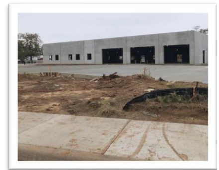
The building is progressing!

All rooms have a 5-year sponsorship with the opportunity to fund the room again in 2025. The remaining rooms are two observation rooms ($2,000 each), four CAC staff offices ( $1200 each), and one Care Closet ($800).